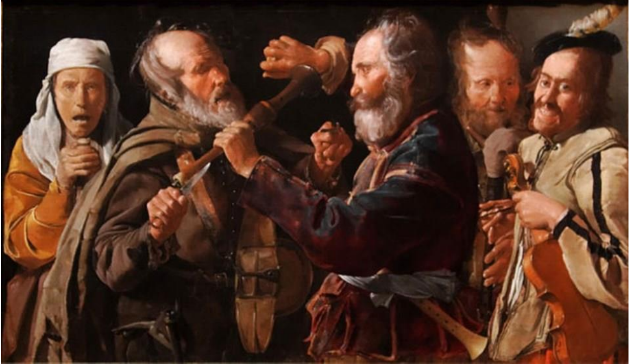
Photo: Georges de la Tour - The Musicians' Brawl

There comes a time when, as human beings, we are powerless to solve some of our problems. The question remains, how do we want to deal with them? Having seen my loved ones going through cancer, the words “fighting cancer” have really struck a chord.